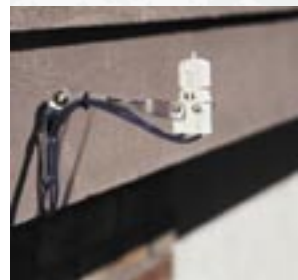
Works with Weather Sensors