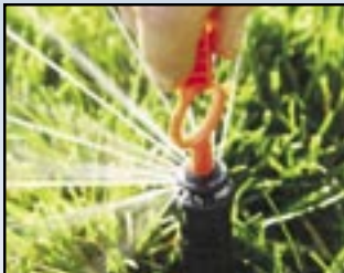
Easy radius adjustment El alcance se ajusta fácilmente