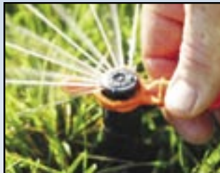
Easy arc adjustment El sector se ajusta fácilmente